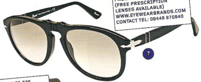
7 PERSOL 649S STARTING FROM £118.00 (FREE PRESCRIPTION LENSES AVAILABLE) WWW.EYEWEARBRANDS.COM CONTACT TEL: 08448 870840