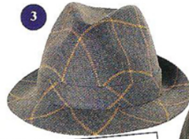
3 NEWURBAN FUNKYTIME TRILBY HAT £35. 9 EXCLUSIVE DESIGNS 6 SIZES. WWW.NEWURBAN.CO.UK CONTACT TEL: 020 7100 9637