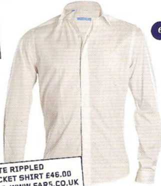
6 WHITE RIPPLED PLACKET SHIRT £46.00 FAR 5 WWW.FAR5.CO.UK