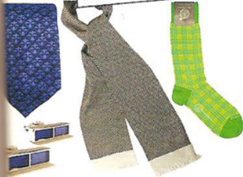
8 CUFFLINKS £40 TIES £50 SOCKS £15 SCARF £79 HANK £25 DENISONBOSTON WWW.DENISONBOSTON.COM TEL: 01273 202095