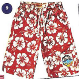
9 RED HIBISCUS SHORTS AUD110.00 INFO@OKANUI.COM WWW.OKANUI.COM