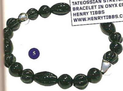
5 TATEOSSIAN STRETCH NUGGET BRACELET IN ONYX £85.00 HENRY TIBBS WWW.HENRYTIBBS.COM