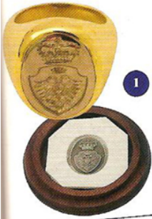
1 SEAL ENGRAVED SIGNET RINGS FROM £300 CNA RUFF. CONTACT TEL: 023 9258 0359