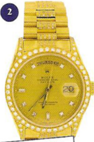
2 18CT ROLEX DAY DATE £12,995 THE WATCH AGENCY WWW.WATCHAGENCY.CO.UK CONTACT TEL: 01702 395100