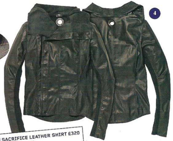
4 SACRIFICE LEATHER SHIRT £320 BY DELUSION WWW.INTRO-CLOTHING.COM CONTACT TEL: 0161 839 5323